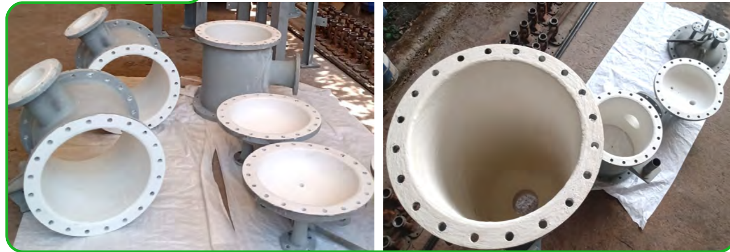
Pipes and Fittings