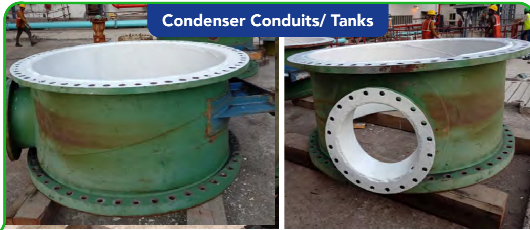
Condenser Conduits/ Tanks